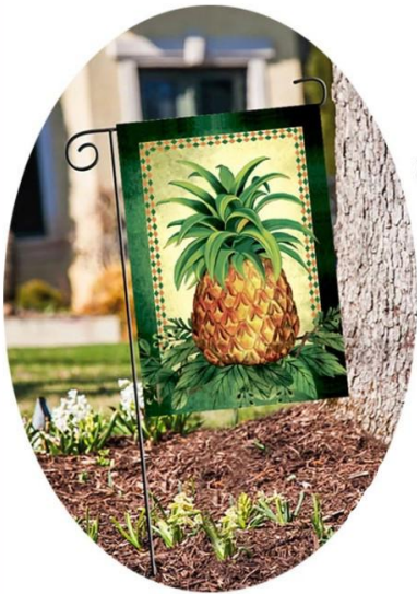
1. KD iron pole to hanging the flag

The garden flag can be in different application scenarios, make the house more alive, that's a very wonderful decoration.