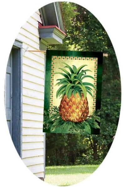
2. Metal flag bracket hold the flag on the wall